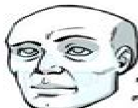
face on top of skull!