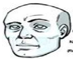
face on top of skull!